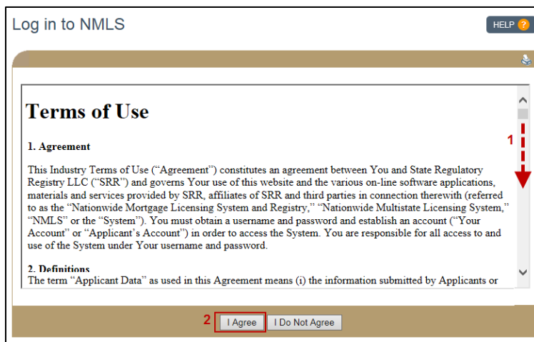
Figure 2: Example of NMLS Terms of Use